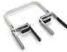
Tub security rail